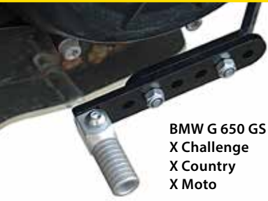
BMW G 650 GS X Challenge X Country X Moto